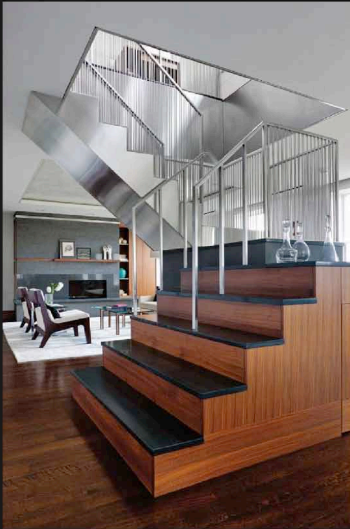
Architect: Hacin + Associates